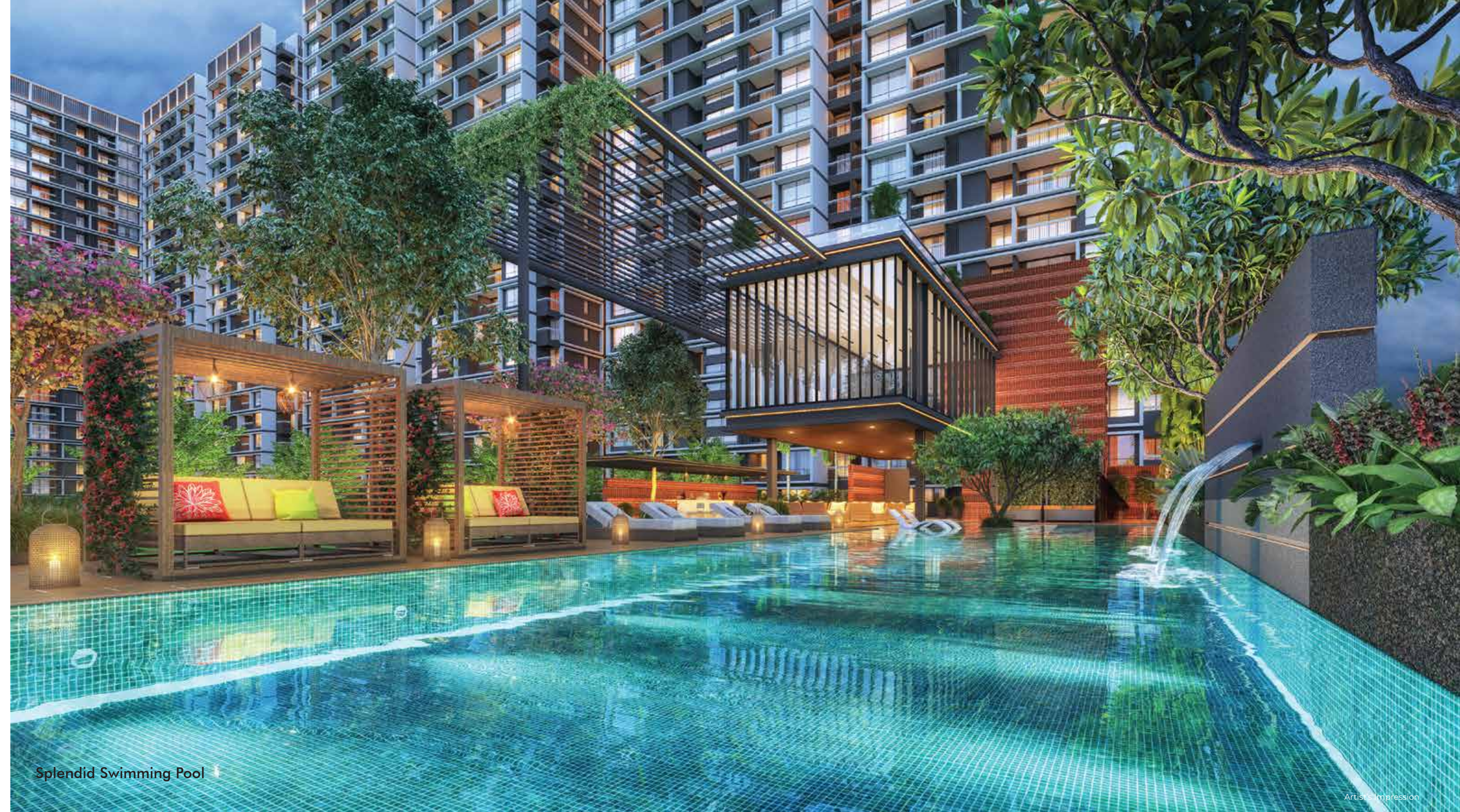
Splendid Swimming Pool